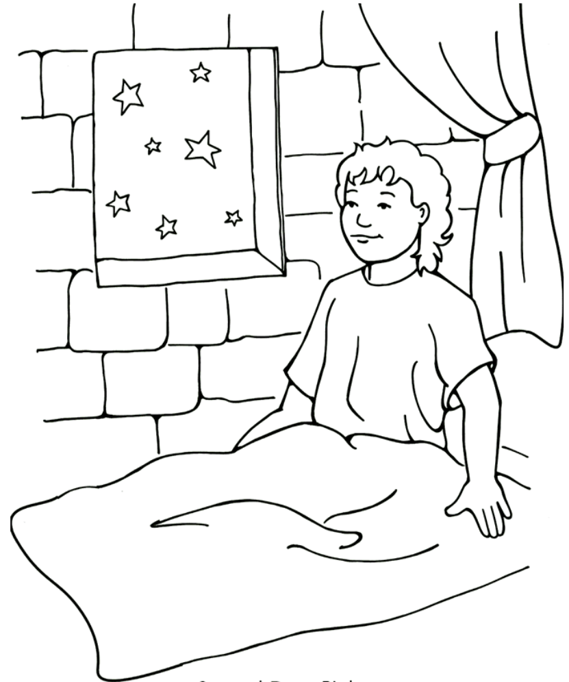
Samuel Does Right 1 Samuel 2-4, 7