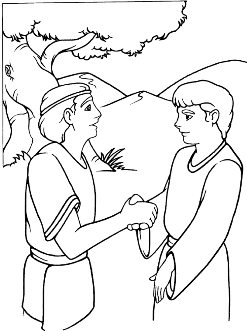
Esau Sells His Birthright to Jacob Genesis 25:19-34

Copyright © CalvaryCurriculum.com Used by Permission