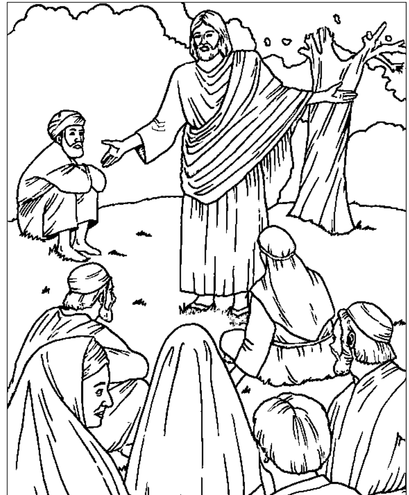
The Sermon on the Mount Matthew 5:1-12

From BibleStoryCard Learning System(tm) Coloring Book © 1996 Wesleyan Publishing House. Used by permission. Additional BibleStoryCard resources are available by calling 1-800-493-7539 or visiting online http://www.wesleyan.org/941/biblestorycards