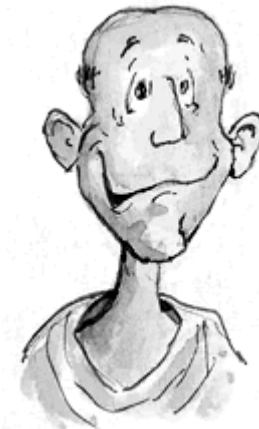
Zacchaeus